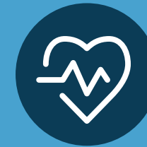
Metabolic heart health